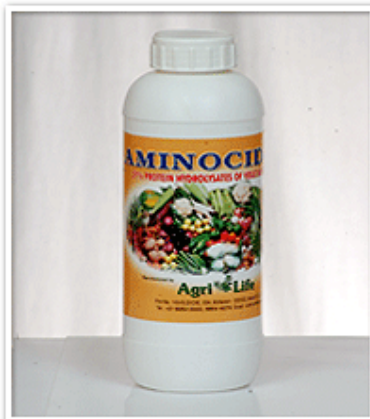
AMINOCID Protein Hydrolysates of Vegetative Origin