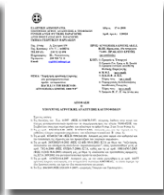
GREECE BT-K REGN