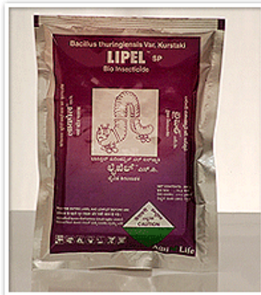
LIPEL Bacillus thuringiensis Kurstaki