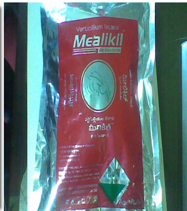
MEALIKIL Verticillium lecanii