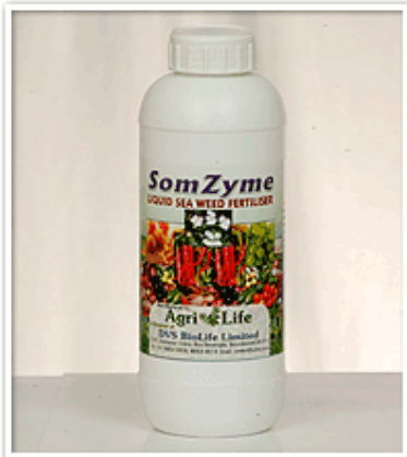
SOMZYME Fermentation Derivates of Seaweed