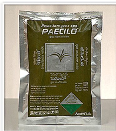
PAECILO Paecilomyces lilanicus