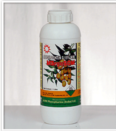
MARGOSOM Azadirachtin (Neem)