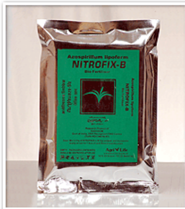
NITROFIX Nitrogen Fixing Bacteria