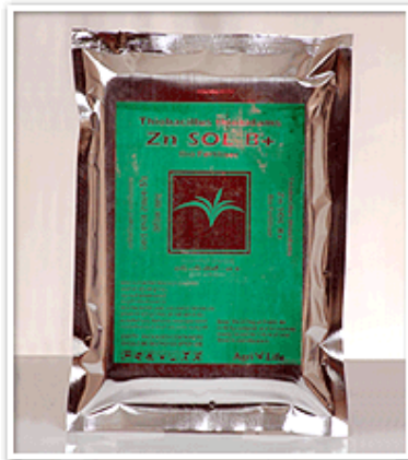
Zn SOL B Zinc Solubilizing Bacteria