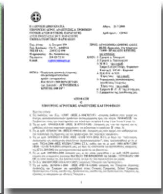
GREECE BT-K REGN