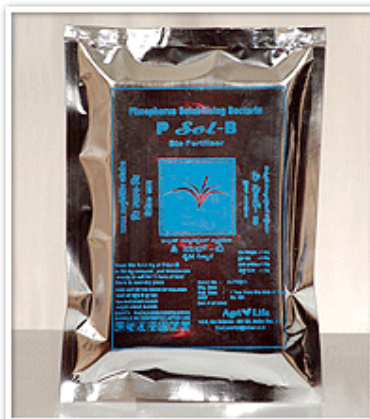
P SOL B