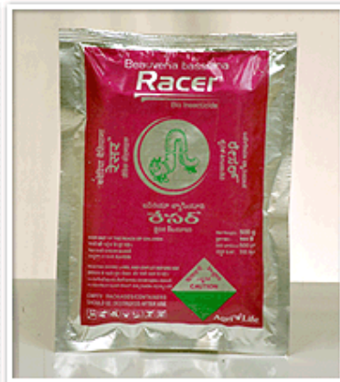
RACER Beauveria bassiana