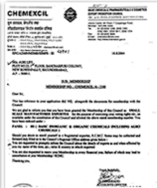
EXPORT REGN CERTIFICATE