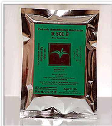
K SOL B