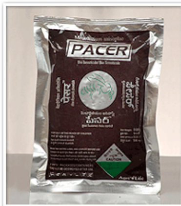
PACER Metarhizium anisopliae