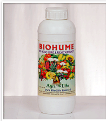
BIOHUME VermiCompost based Humic and Fulvic Substances