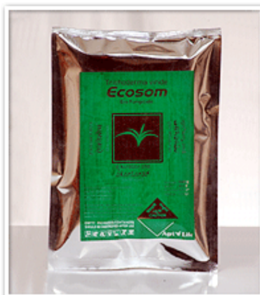
ECOSOM Trichoderma viride