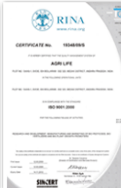
ISO 9001-2000 CERTIFICATE